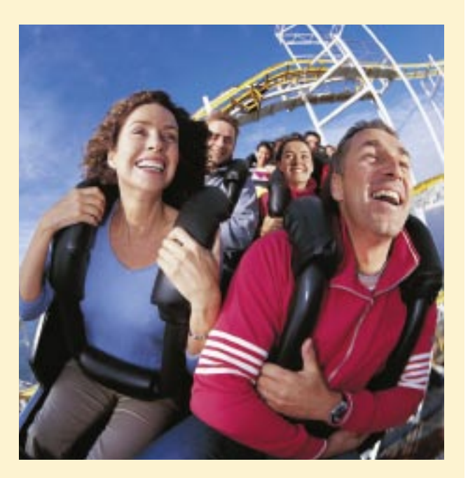
Riding a roller coaster or experiencing other thrills with your partner can help you bond emotionally by boosting arousal and making you each feel vulnerable.

Touch and sexuality. The simplest touch can produce warm, positive feelings, and a backrub can work wonders. Even getting very near someone without actually touch-